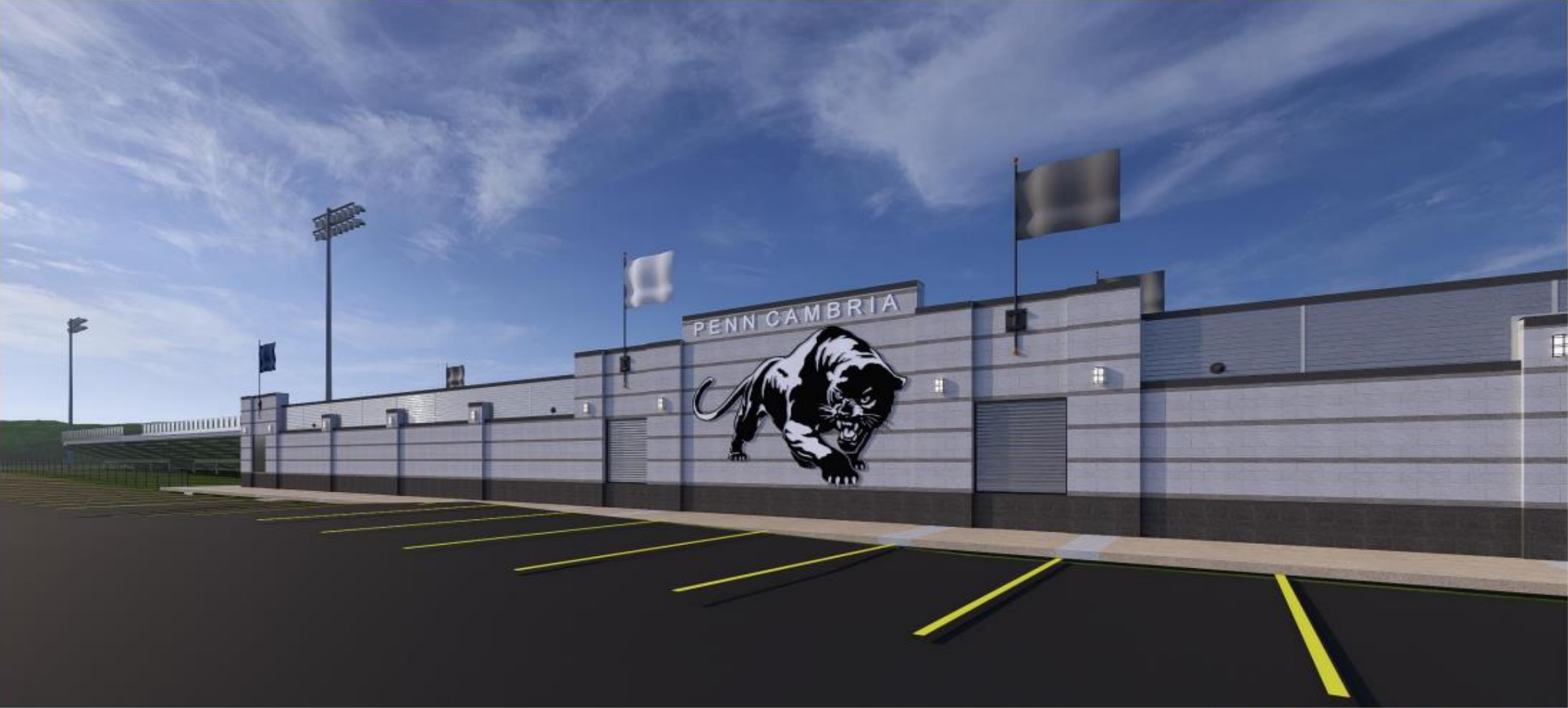
Fieldhouse view from New Parking Area