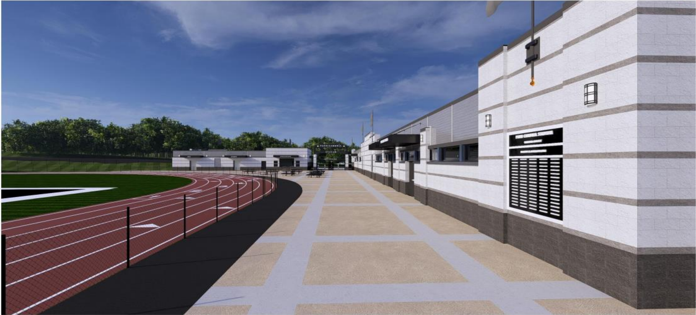
View along Fieldhouse looking toward Entrance Gates and Amenities Building