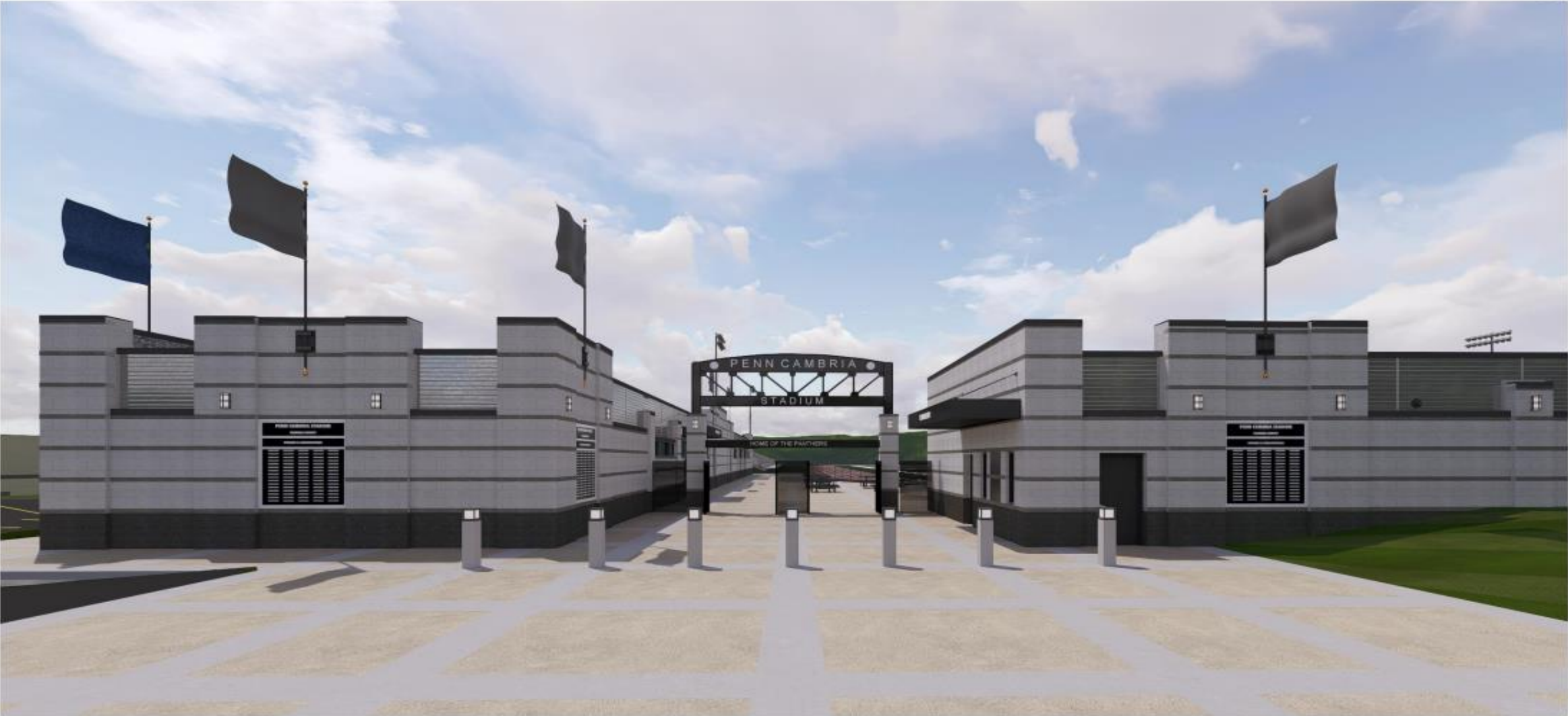
Entrance Gates and Ticket Booth view looking toward New Stadium