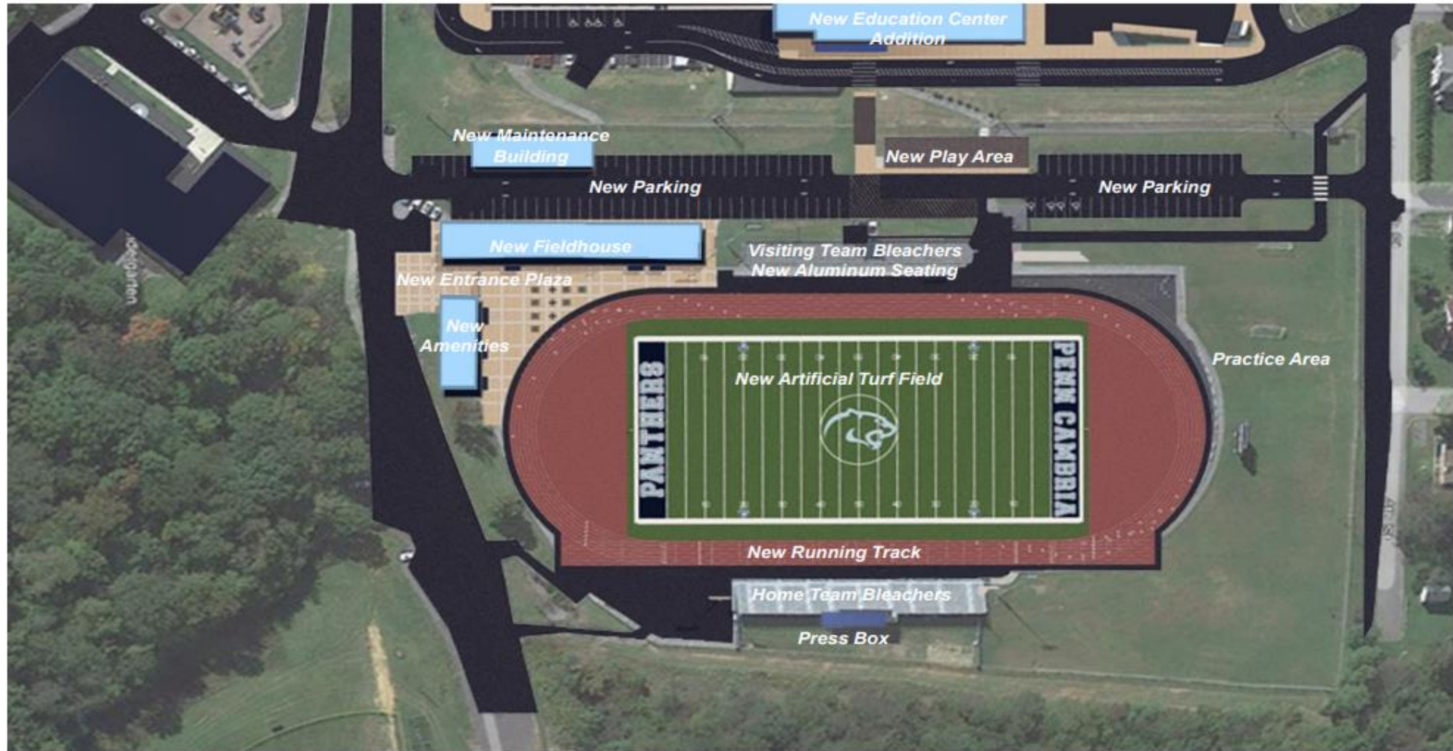
Penn Cambria High School Stadium – Proposed Improvements