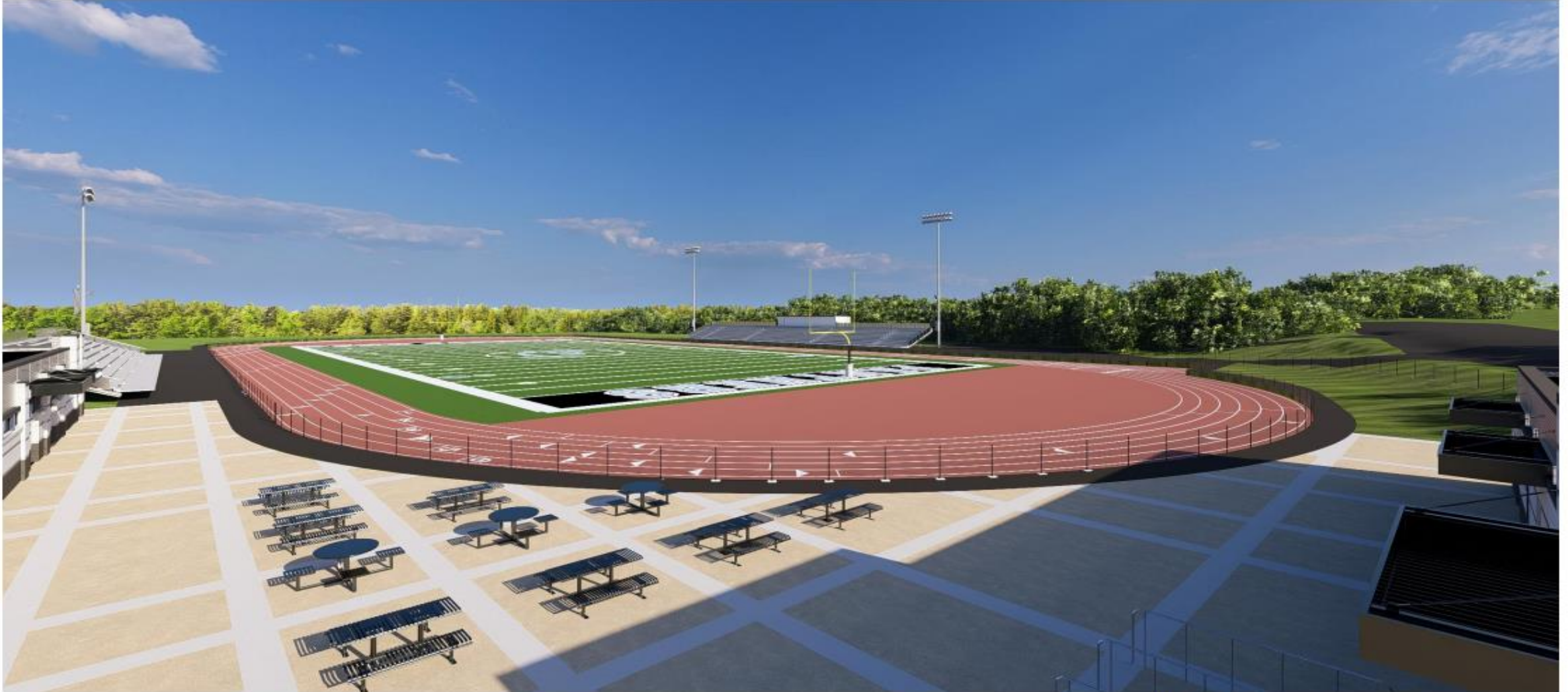
Field and Plaza view from inside Entrance Gates