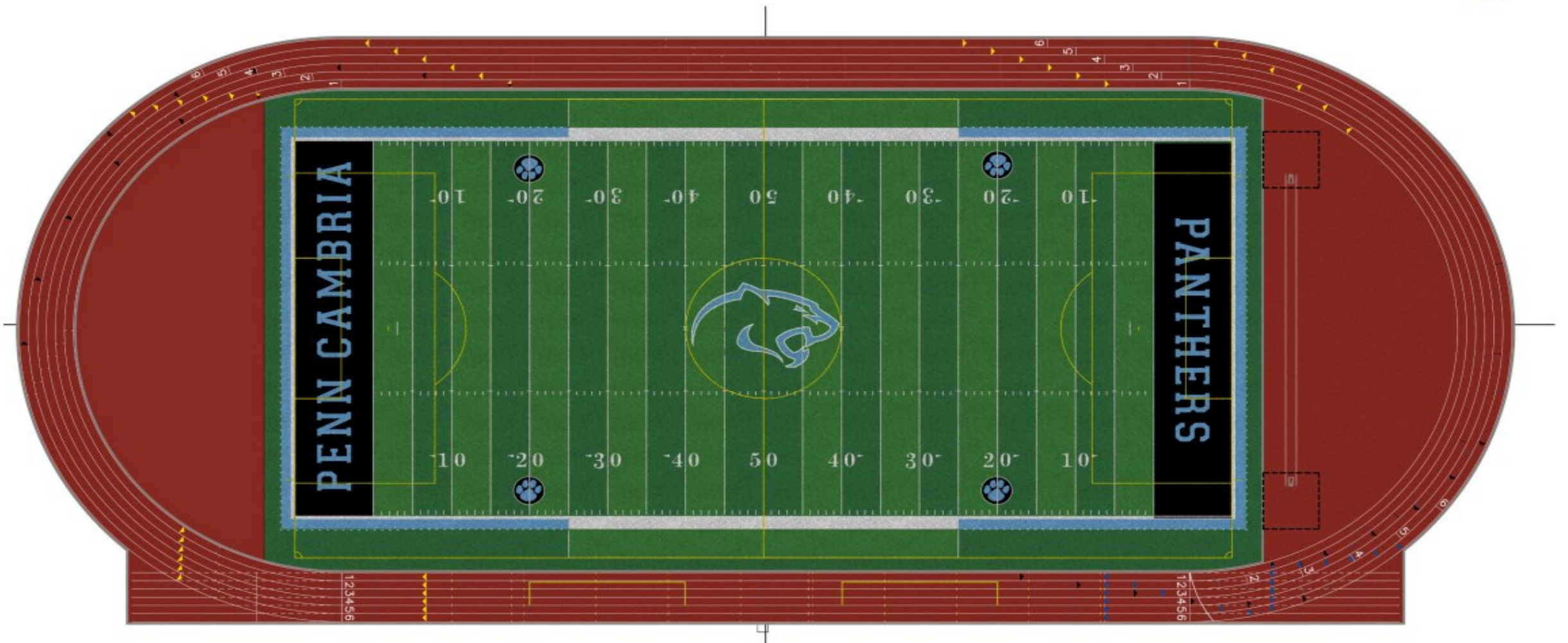
New Artificial Turf Proposed Field Graphics