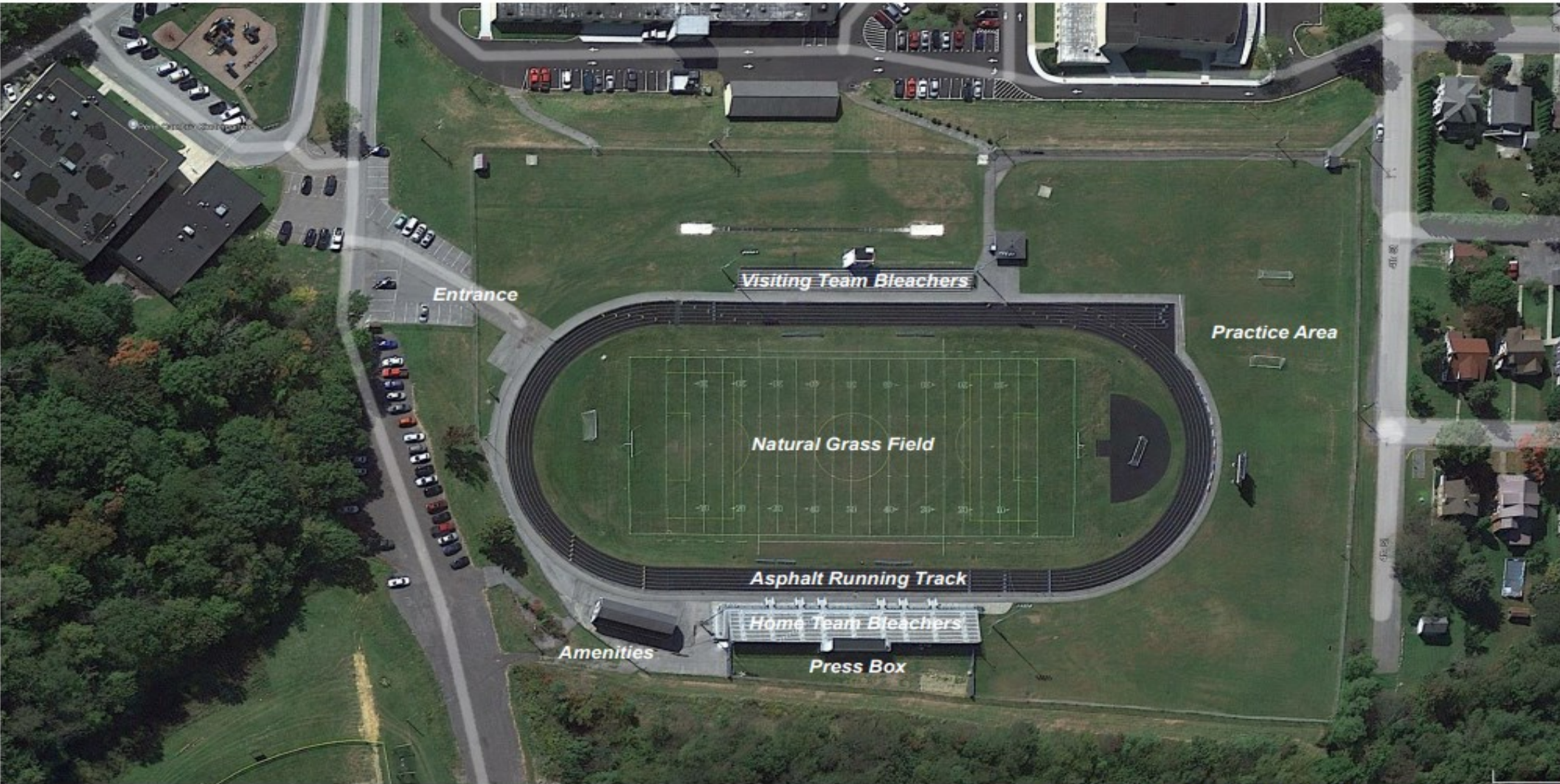
Penn Cambria High School Stadium - Current Satellite Image