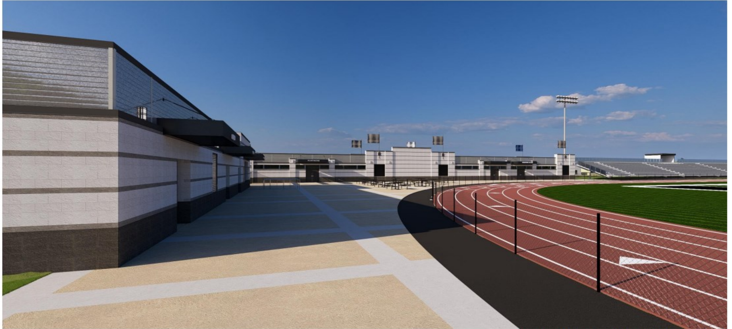
Amenities Building and Fieldhouse view from Plaza