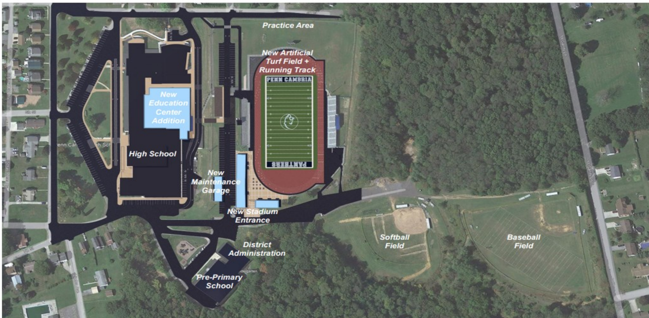
Penn Cambria High School Campus – Proposed Master Plan