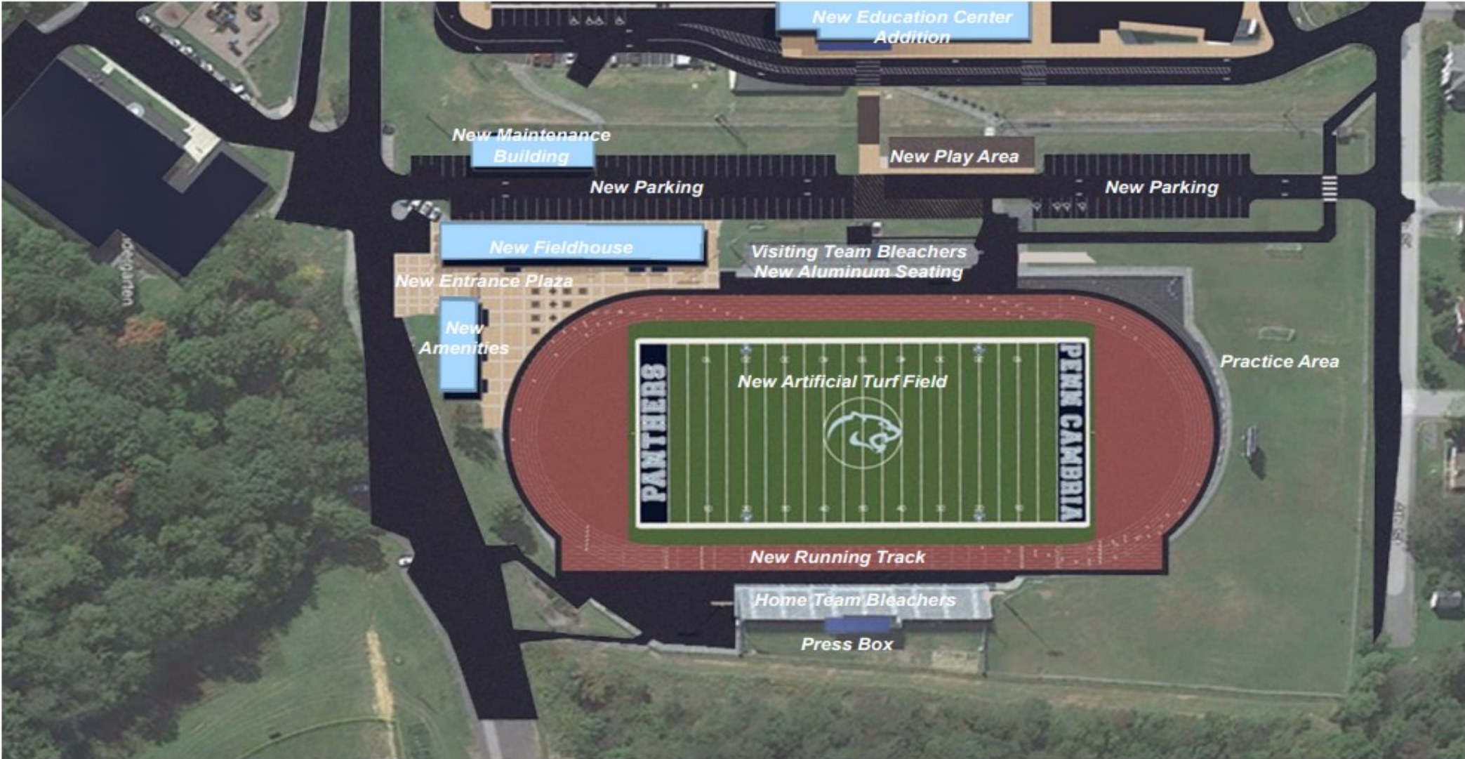
Penn Cambria High School Stadium – Proposed Improvements