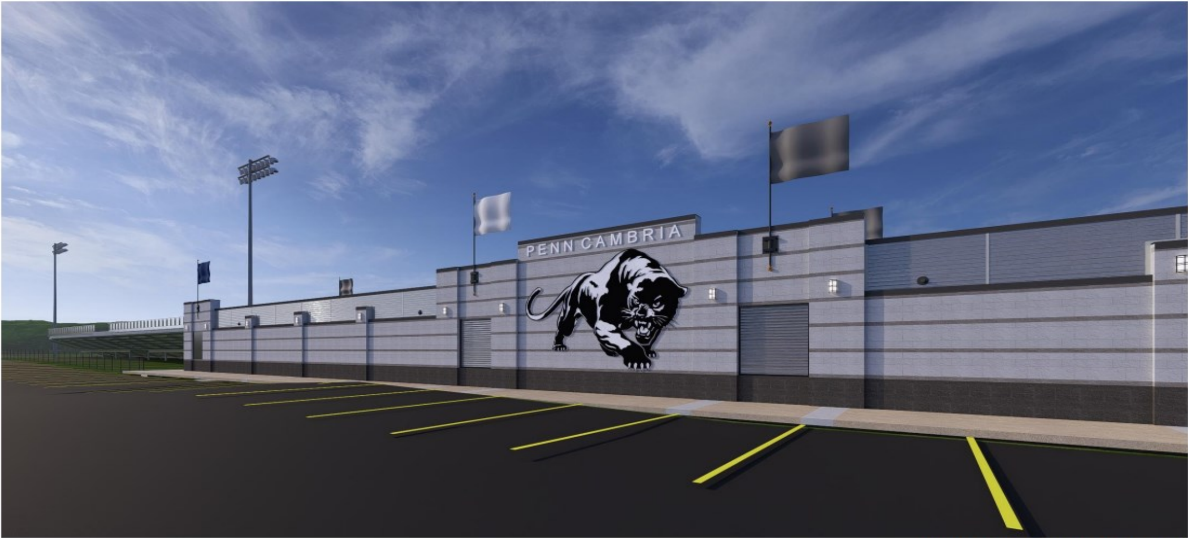
Fieldhouse view from New Parking Area