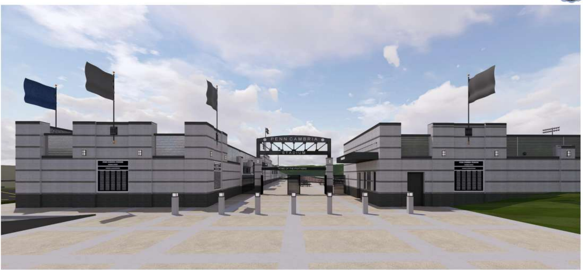
Entrance Gates and Ticket Booth view looking toward New Stadium