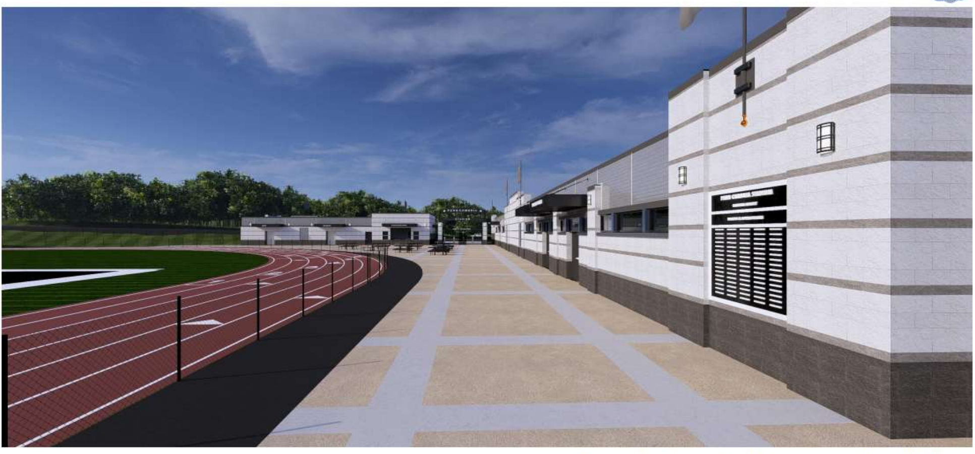
View along Fieldhouse looking toward Entrance Gates and Amenities Building