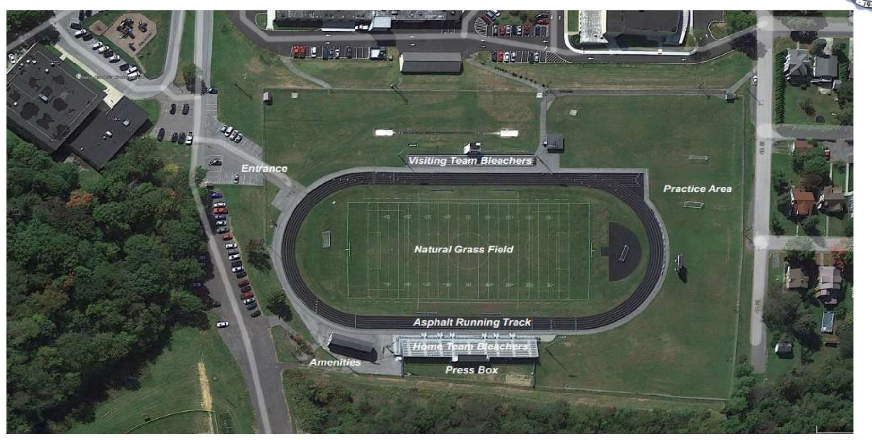
Penn Cambria High School Stadium - Current Satellite Image